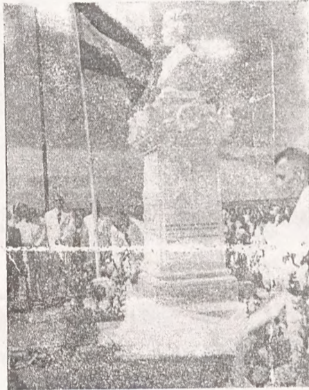
After the unveiling, the statue is surrounded by a sea of flowers.